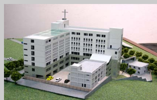
An architectural model of the finished China Seminary building