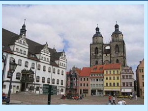
Lutherstadt Wittenberg Market Square