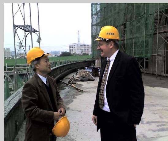
China Lutheran Seminary, Taiwan