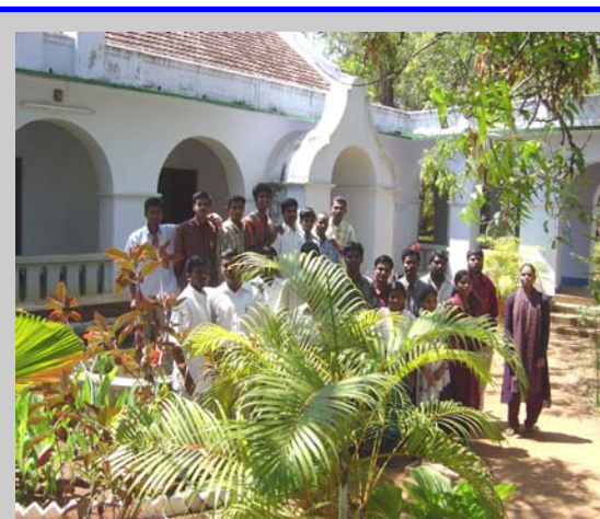
Concordia Seminary Nagercoil students outside the classrooms