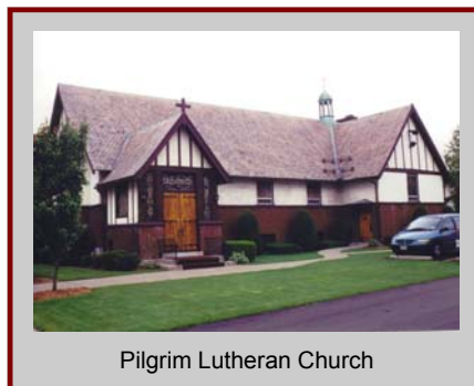
Pilgrim Lutheran Church

Sometimes congregations hesitate to participate in endeavors like "Fan into Flame" because they think that it will take away from their at-home contributions. As far as we are concerned, that has not been our experience. In fact, it is our conviction that giving to "Fan into Flame" encourages giving at the local level. Members discover (or re-discover) the joy of giving, and the Lord continues to supply the giver with more resources so that he or she may continue to give generously (2 Corinthians 9:6-15). All in all, our participation in "Fan into Flame" has been a blessing for our congregation. Our prayer is that our participation may be a blessing to others as they come to know of Jesus' love through "Fan into Flame."